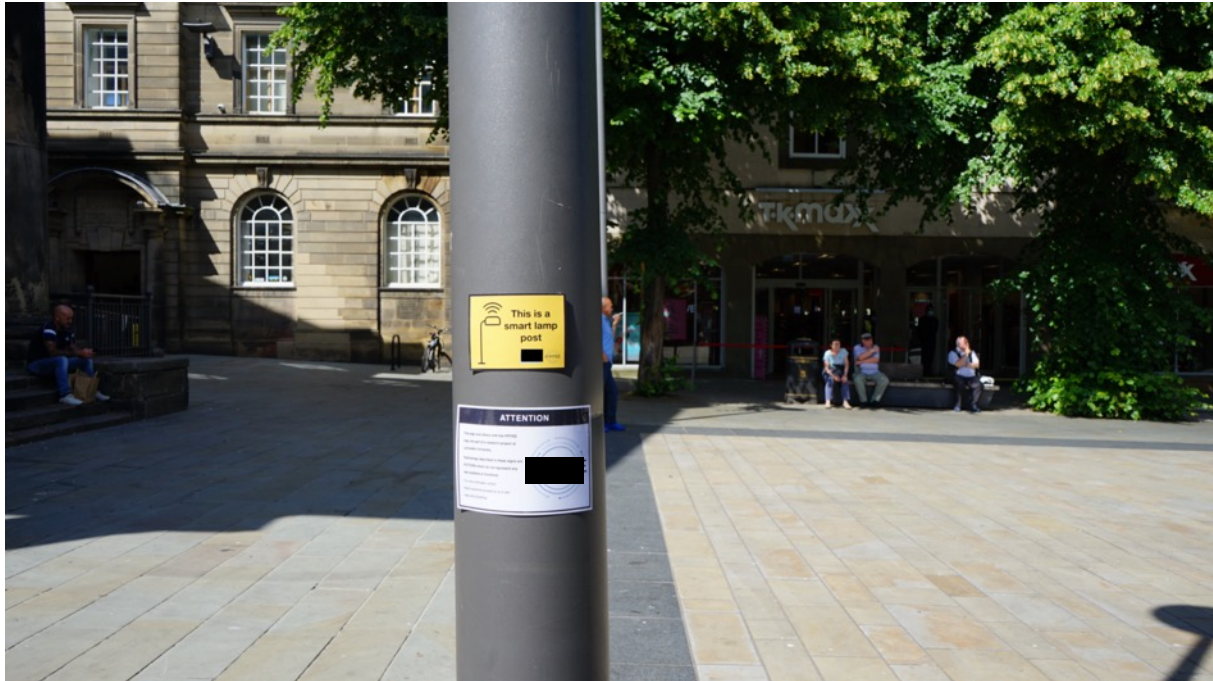
Figure 2. Example of signage provided at each of the 8 stops on the walk

The symbols on the signs were an amalgamation of existing signage, including from the previous Trustlens project, new material, and the symbols created for a research project exploring legibility of AI design (Lindley et al, 2020). The signs all employed different visual languages to represent the different types that might be used where different sensors or processing devices are owned by different organisations.