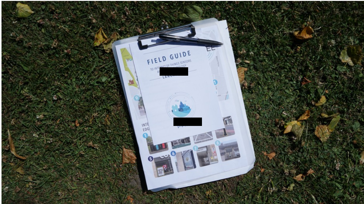
Figure 1. Field Guide provided for participants for both walks

Stickers were provided between questions 2 and 3 which gave the participants more information about each device (beyond what could be observed, such as data management details) and marked them as 'True' or 'False', according to whether each device actually existed as part of a real deployment, or whether it was a design fiction. The aim of the guide was to encourage participants to engage in thinking through the different questions and to record this for our research purposes.