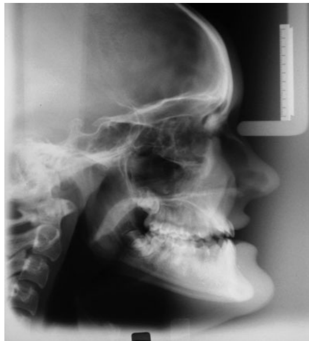
Fig. 4 Lateral cephalometric radiograph of the same patient in Fig. 2 showing a class III skeletal pattern with mandibular prognathism, anticlockwise rotation of the occlusal plane, retroclined lower incisors, and retroclined upper and lower lips.