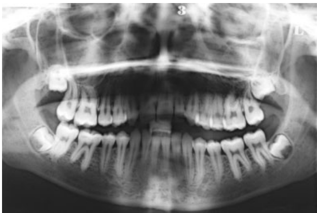
Fig. 3 Orthopantomography of the same patient in Fig. 2 confirming the congenital absence of 12.

axis. 11-13 This decrease in the lower face height can be ascribed to the anterior rotation of the mandible resulting from a smaller number of teeth and, thus, less support. 11,15 Some previous studies have reported a reduction in the length of the maxillary and mandibular alveolar bone in severe hypodontia. 14,16 However, these findings contrast other investigations which showed no reduction in the maxillary and mandibular alveolar bone height in mild or severe forms of hypodontia. 11,18