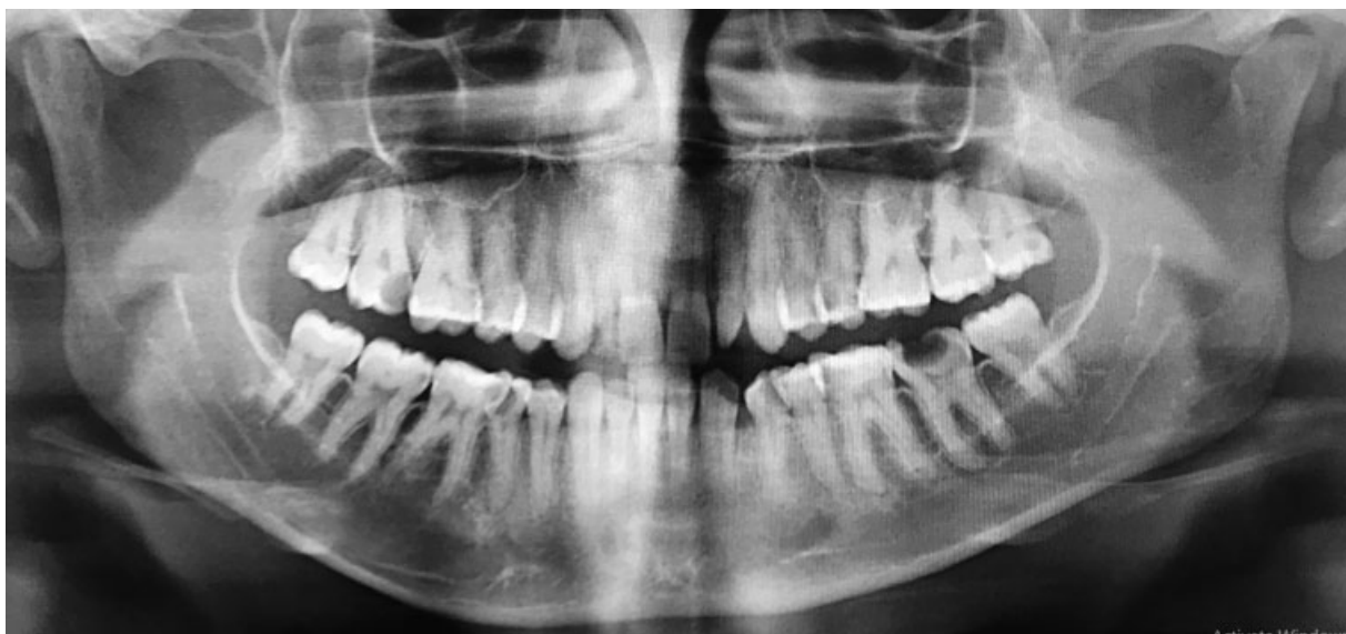
Fig. 6 An orthopantomography of the same patient in (►Fig. 2) with congenitally missing 32 associated with a peg-shaped 22.

There is a lack of studies investigating root dimensions in patients with hypodontia. A recent study 33 has compared root length and widths of the permanent teeth in mild hypodontia patients with controls and showed that patients with one or two congenitally missing teeth had a shorter root