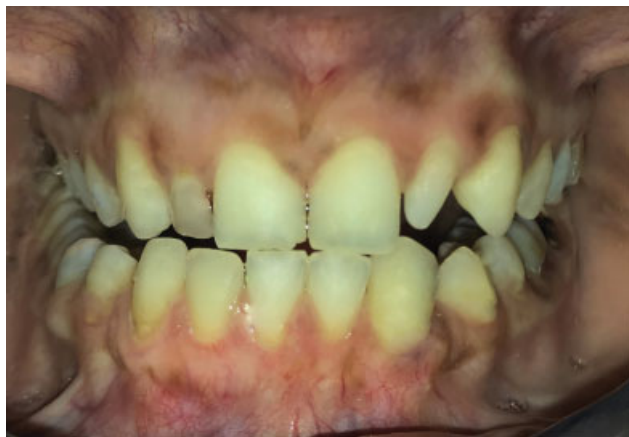
Fig. 5 An intraoral photograph of a patient with congenitally missing 32 associated with a peg-shaped 22.