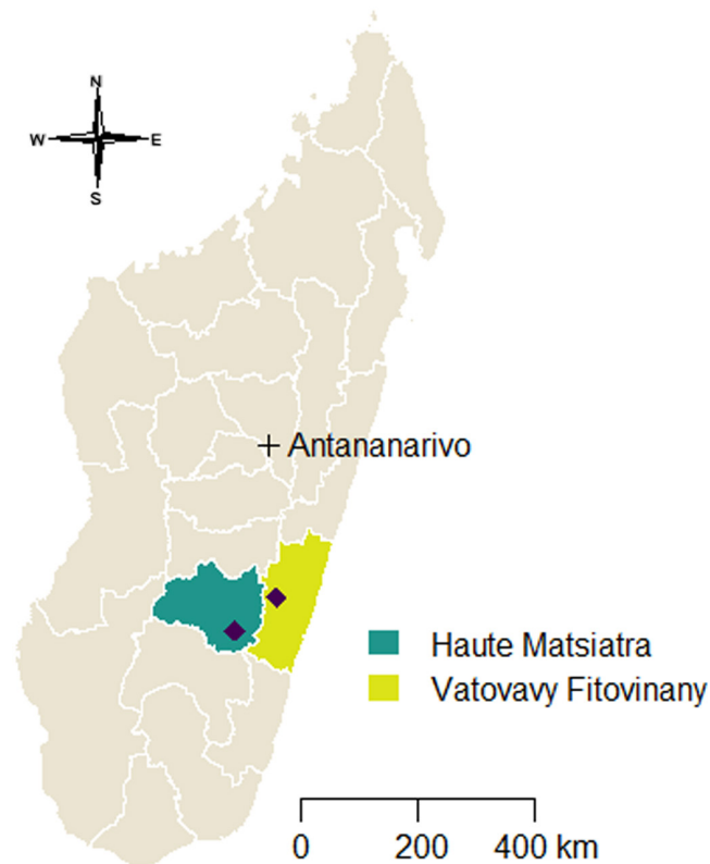
FIGURE 1 Geographical location of the two communes within which focus groups were conducted (indicated by ♦). The two communes are located in the Haute Matsiatra and Vatovavy Fitovinany regions (highlighted in green and yellow).

and the lead investigator (KS). Discussions began with a broad question on the types of agriculture practiced within the community, followed by a question on the challenges faced by farmers, and ended with a question on the participants' opinions on rats. The focus group schedule is provided in Appendix S2.