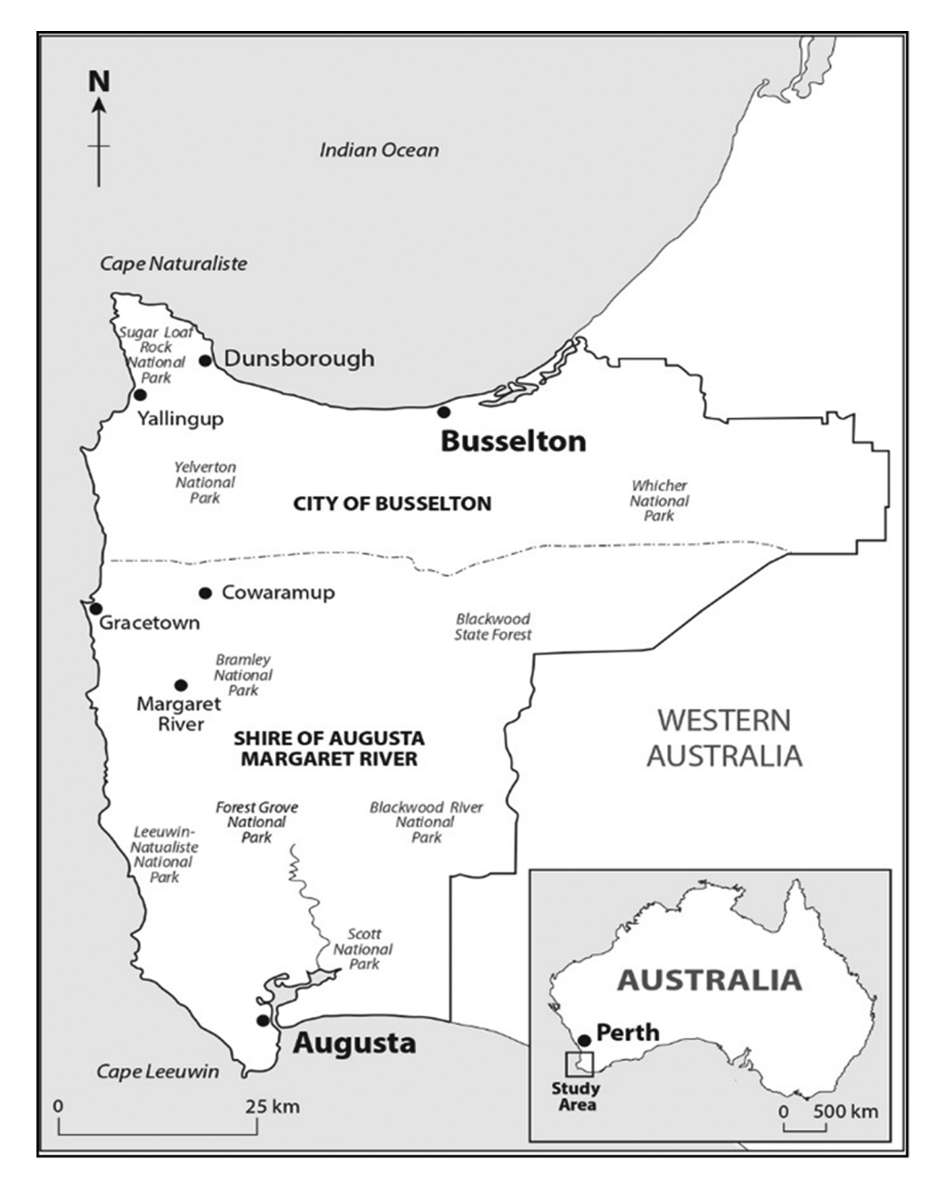
Figure 1. The Margaret River region in Western Australia.

available sources including newspaper and magazine articles, institutional reports, and websites of tourism-related institutions and firms dating back to 1848 (only fourteen years after the first settlement in the MRR) (see Perth Gazette, 1848). The main databases included the National Library of Australia, ProQuest database, and Factiva, with the following searching codes used: 'tourism', 'timber', 'dairy', 'caves', 'wine', 'wine-tourism', 'Margaret River', and 'Busselton'. All the documents were organised chronologically.